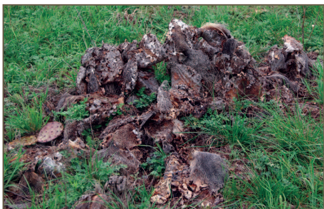
Figure 14. Pricklypear controlled with herbicides.

Individual plant treatments are considered most effective because spray can be targeted directly onto pricklypear.