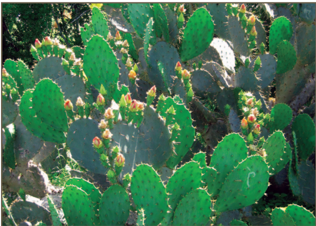
Figure 2. Lindheimer pricklypear.

Lindheimer pricklypear is considered the most abundant and widespread in Texas. The typical Lindheimer pricklypear is 2 to 5 feet high. Its oval pads are 8 to 12 inches long and covered with erect, yellow spines. More common in the Edwards Plateau region is Edwards pricklypear. It is usually less than 1 foot high and has 4- to 6-inch rounded pads covered with slightly curved, gray