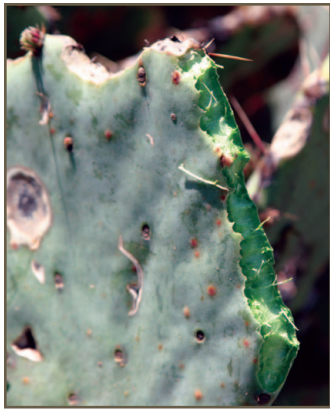
Figure 12. Deer browsed pad.

dry summer months when deer consume pricklypear presumably for the water source. Wildlife also relish young leaves in the spring and fruits in the fall. Pricklypear is an extremely important source of cover and protection for ground-nesting birds, especially bobwhite quail. Quail and other birds also eat the fruits.