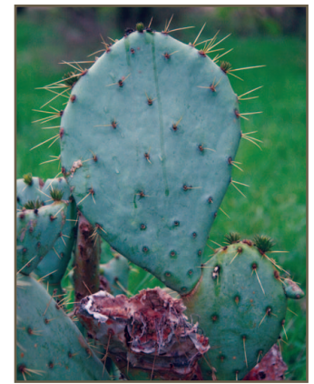
Figure 8. Mature pads.

Mature pricklypear pads have thick, fleshy coverings coated with a heavy wax that makes the plant appear shiny. This thick, tough skin, along with the succulent nature of cacti, helps plants survive during drought. The plants use most of their internal tissues for water storage and their outer parts to reduce water loss and damage by grazing animals and predatory insects. They can remain relatively vigorous in hot, dry conditions that cause most other plants to lose vigor or even die. The pad surfaces are covered with small bud zones called areoles. From these areoles emerge either short, dense spines or longer, heavier spines (1 to 4 inches), or both. Pricklypear species cannot be identified by spine characteristics alone because there is so much variation within species. Flowers and new stems also emerge from areoles.