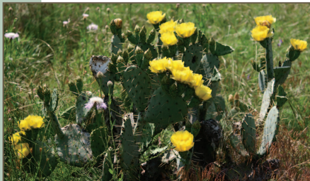
Figure 1. Engelmann pricklypear.

Pricklypear is the common name given to a large group of succulent cacti in the Opuntia genus. This genus is the most widespread and common of all cacti (Cactaceae family) in the world. There are more than 40 species and varieties in Texas, including pricklypear, tasajillo and cholla cactus. Most