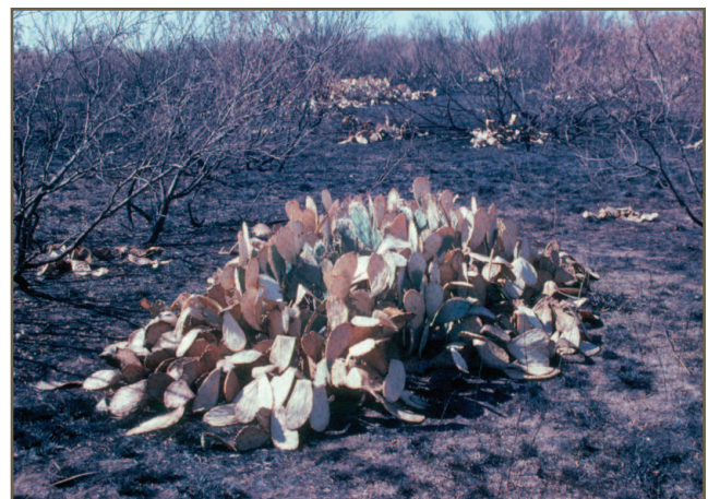
Figure 13. Pricklypear after a summer fire.

For effective control of pricklypear, fires must be very hot to rupture pricklypear cells and physically damage the plant. Summer fires are more effective than winter fires.