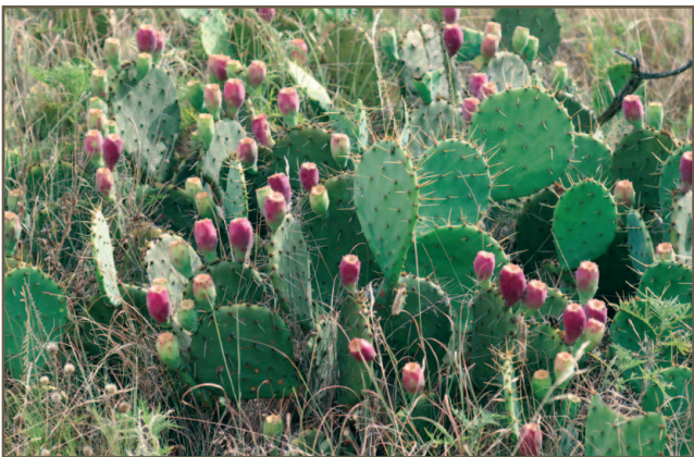
Figure 3. Engelmann pricklypear.

spines. Engelmann pricklypear grows to 6 feet or more and has the largest pad, at 8 to 16 inches long, with white spines. It is scattered throughout the Edwards Plateau and Trans-Pecos regions. Plains pricklypear is typical of the Rolling and High Plains regions and is a short, spreading variety.