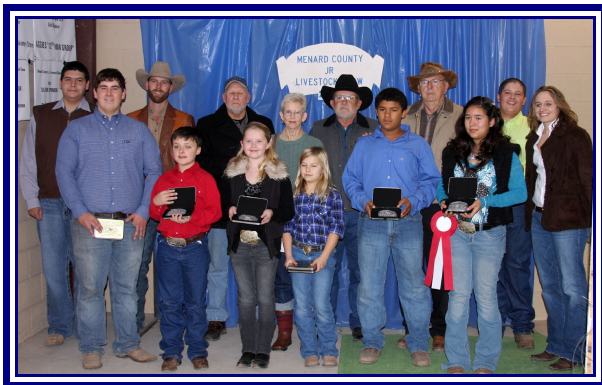
2011 Jr & Sr Showmanship Winners

Thank you for supporting our 4-H and FFA youth of Menard County.